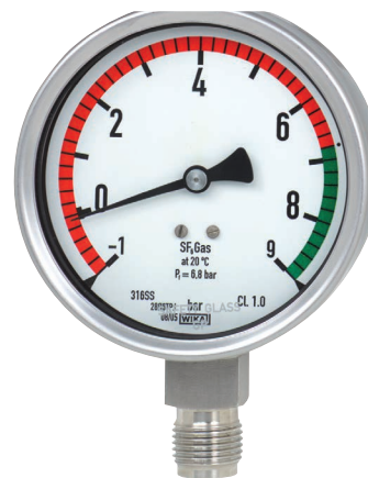
Gas density indicator model GDI-100